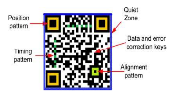
Fig. 3. QR-Code